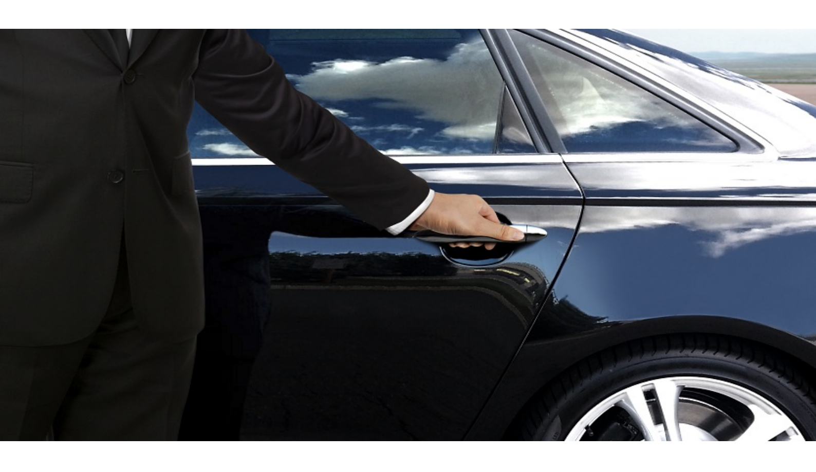
Private Transfer: Transfer from Zagreb Airport to Rovinj City