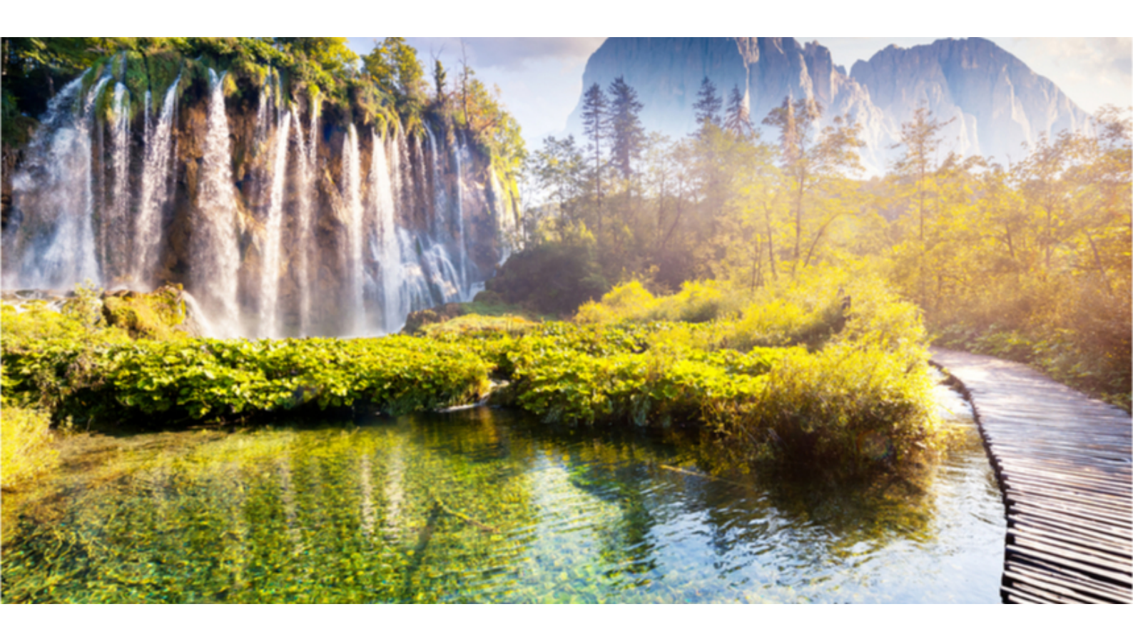
Private Tour with Car: Zagreb to Split with Plitvice Lakes Visit Stop

Description: After meeting your driver from your hotel in Zagreb you will start your picturesque journey to Plitvice National Park. Where you will be joined by your experienced English-speaking guide to begin your tour. Plitvice are one of the most beautiful European natural resources. The turquoise color of these 16 lakes comes from the deposits of calcium carbonate, while thick woods and intact nature show elements of virgin forests. The park is the habitat of various kinds of birds and small game, as well as deer, bears, wolves, bears, wild cats, and in the crystal-clear water of these lakes, you will see trout. Miles long visitor paths relate to wooden bridges, and the visitors can also use small tourist trains. On the biggest Kozjak lake, you can take a tour on an electrical boat connecting the upper and the lower lakes (gornja i donja jezera).