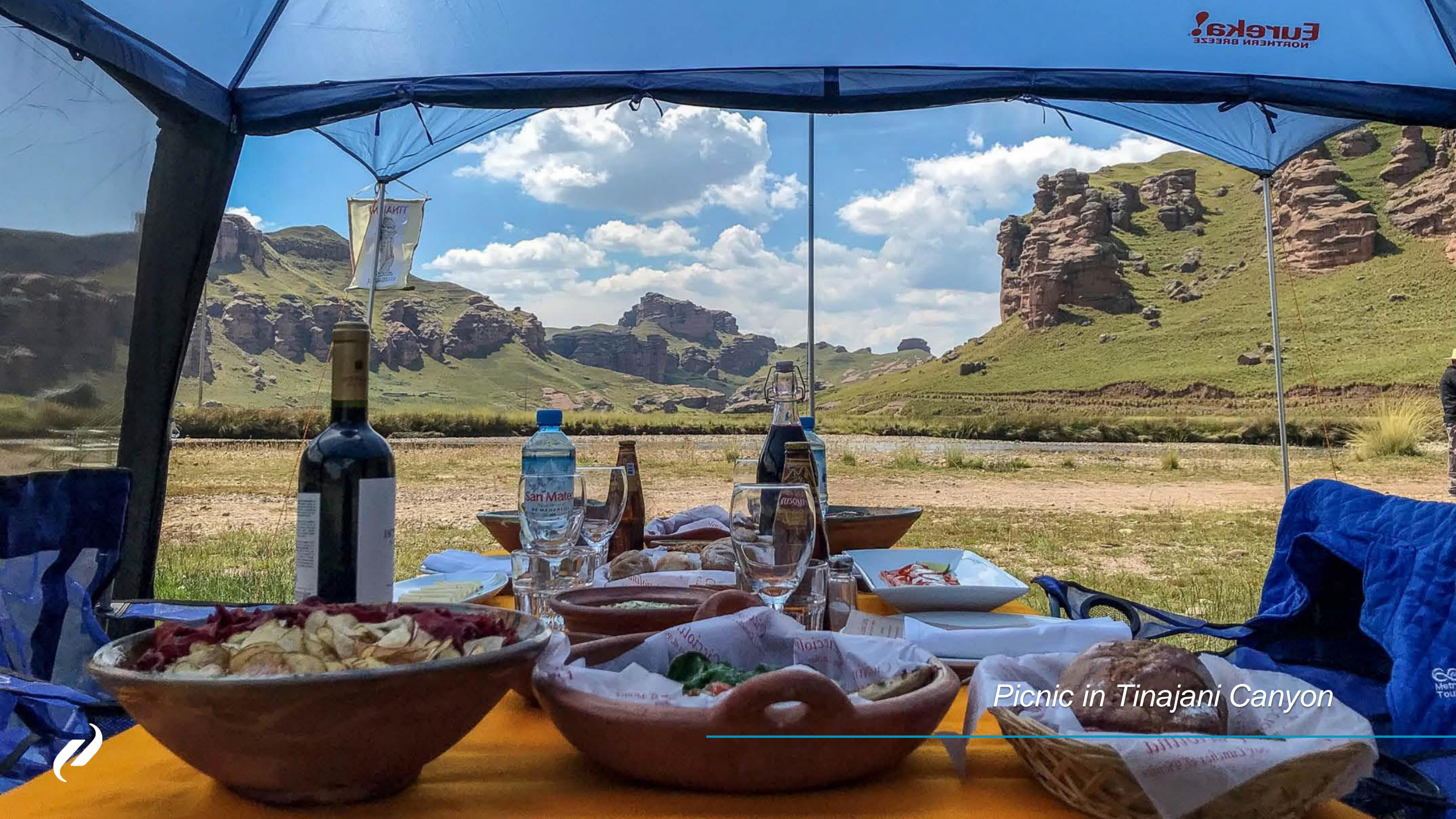
Picnic in Tinajani Canyon