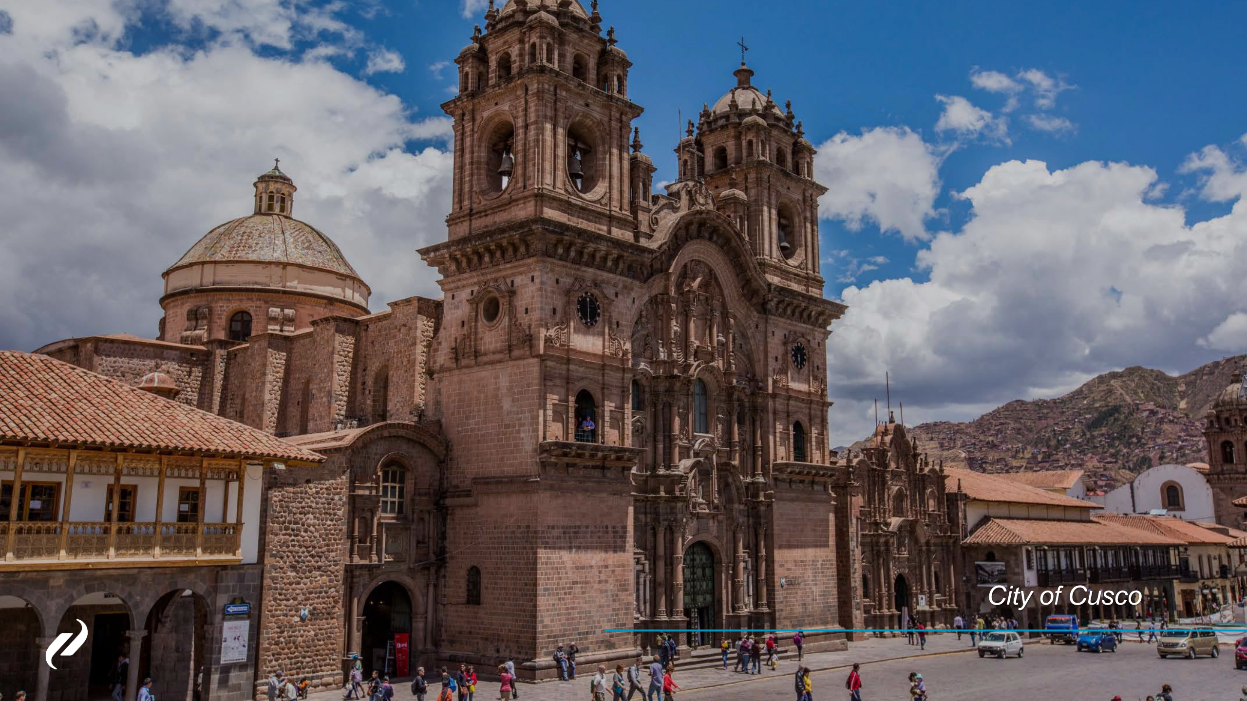
City of Cusco