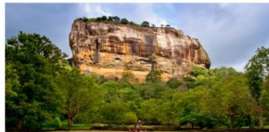
SRI LANKA AT ITS BEST