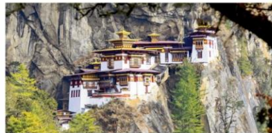
THE LAND OF THE THUNDER DRAGON