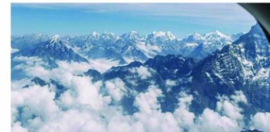
HIGHLIGHTS OF NEPAL