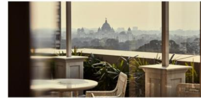
COLONIAL HISTORY, TEA GARDENS & WILDLIFE IN EASTERN INDIA