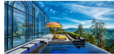
WILDFLOWER HALL MASHOBRA