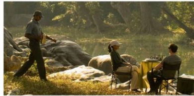
CENTRAL INDIA – TIGER SAFARI AND THE TAJ