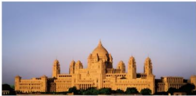
TAJ UMAID BHAWAN