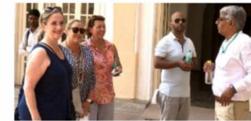
EXPERT TOUR GUIDES