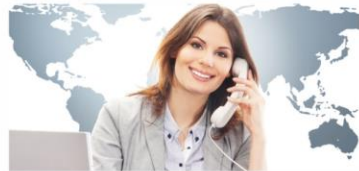
SINGLE POINT CONTACT