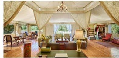
THE ULTIMATE TRAVELLING CAMP