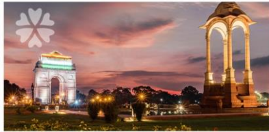
GOLDEN TRIANGLE & THE HIMALAYAS