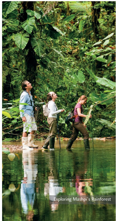
Exploring Mashpi's Rainforest

Watch as the Chocó's secrets reveal themselves to you along ground-level treks and rides through the tree tops aboard Mashpi's unique "Sky Bike." Marvel at the landscape after ascending through the canopy via the observation tower. Brace yourself for the waterfalls that line our nature trails. Enjoy the hummingbirds and butterflies as they flit around you. Satisfy your scientific curiosity with our resident biologists.