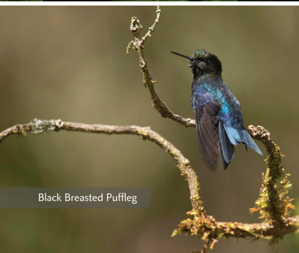
Black Breasted Puffleg

The exuberant plant life is even richer. Orchid species alone number into the many hundreds and bromeliads and ferns abound. Round the curve on any of our well-designed walking paths and discover monkeys, peccaries, and pumas.