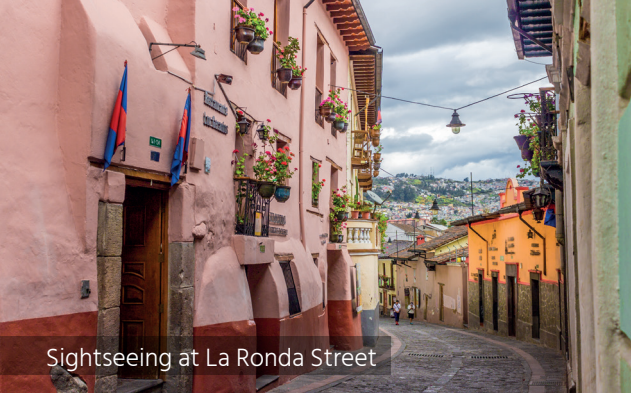
Sightseeing at La Ronda Street