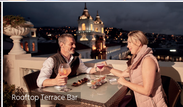
Rooftop Terrace Bar