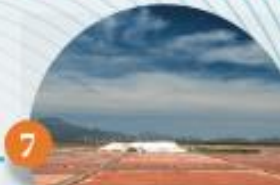
Conti Vecchi Saltworks

Sardinia's most long-established saltworks that stretch over 2700 hectares