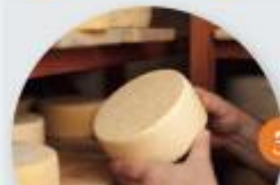
Cheese Making with local shepard

During our cheese experience tour you will visit a local shepard, where you will discover how cheese is made