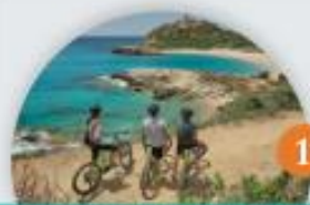
Roman Road to Chia

The Roman Road to Chia, connected to the ancient city of Nora, ideal for both beginners and more advanced bikers.