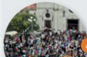
Town of Pula

Pula is a famous seaside village which hosts exciting festivals, fresh markets and plenty of sun!