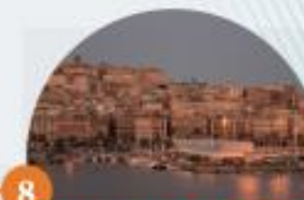
Town of Cagliari

Cagliari is the capital of Sardinia - an awe inspiring city and the perfect place to explore on foot.