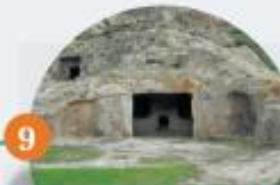
Necropolis of Montessu

One of Sardinia's most important archaeological sites, that occupies a natural rocky amphitheatre in the verdant countryside. It dates back to the 3rd millenium BC and is considered one of the largest in Sardinia.