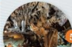
Caves of Is Zuddas

One of the natural wonders of Sardinia, the caves date back 530 million years.