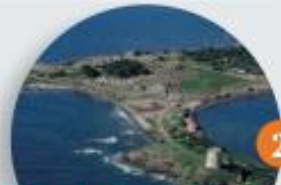
Nora - Archeological Park

The city of Nora was the first Phoenician city of Sardinia, it is still considered one of the best-preserved, most important historical sites of the whole island.