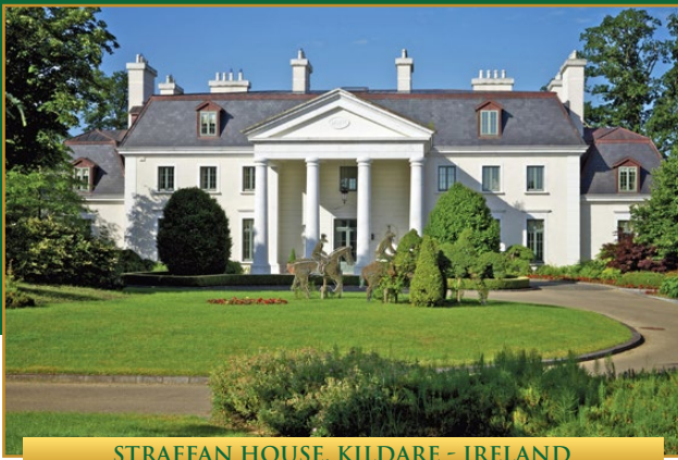
STRAFFAN HOUSE, KILDARE - IRELAND

EXPERIENCE EXCLUSIVE USE OF DUAL ESTATES IN THE IRISH COUNTRYSIDE AND LOIRE VALLEY