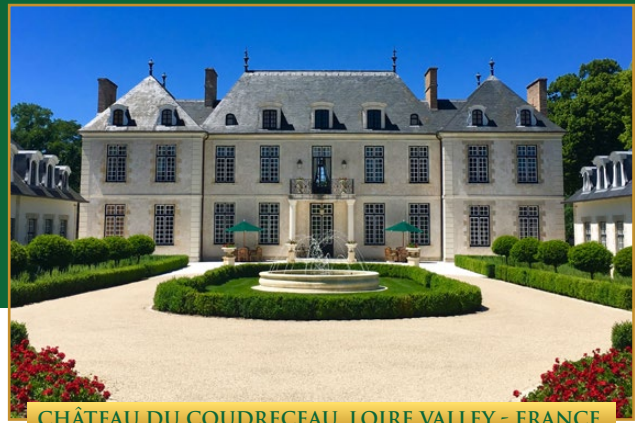
CHÂTEAU DU COUDRECEAU, LOIRE VALLEY - FRANCE

S traffan House is a private house hotel on the grounds of The K Club, nestled in the heart of Kildare, just 30 minutes from Dublin Airport and the city center. The 34,000 sq ft. house overlooks the Ryder Cup course, has an indoor swimming pool, gym, home cinema, game room and wine cellar in addition to its 10 bedrooms, drawing, dining and reception rooms.