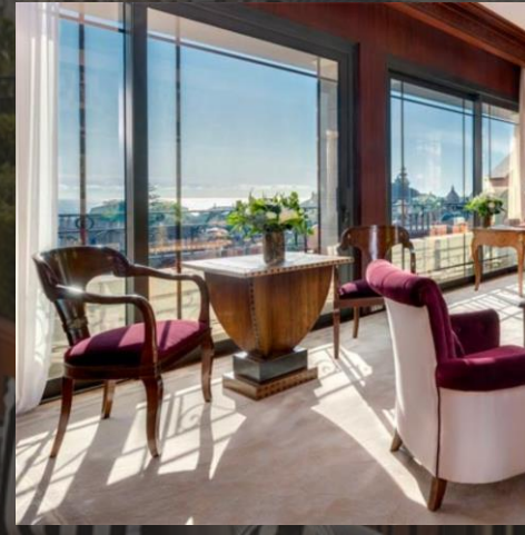
Two-night stay for two people at the Métropole's Carré D'Or Suite in a 195m 2 suite located on the 7th and last floor with a 110m 2 terrace and a panoramic view of the Carré D'or, the Casino Monte-Carlo and the Mediterranean Sea