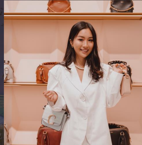
Private shopping experience at The Mall Sanremo