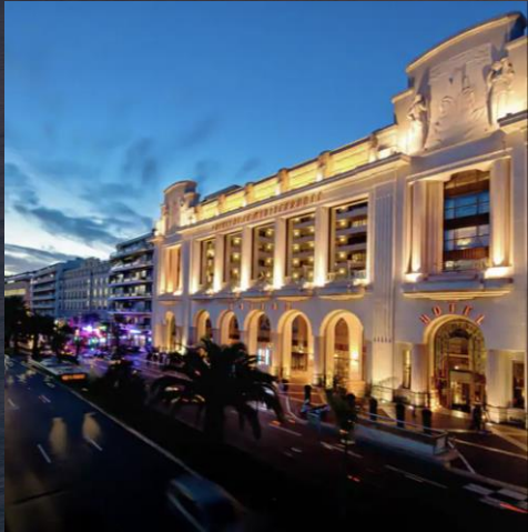
Stay at Hyatt Regency Nice Palais de la Méditerranée with breakfast