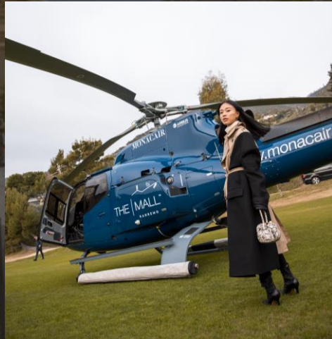
Helicopter transfer from Nice airport to Monaco