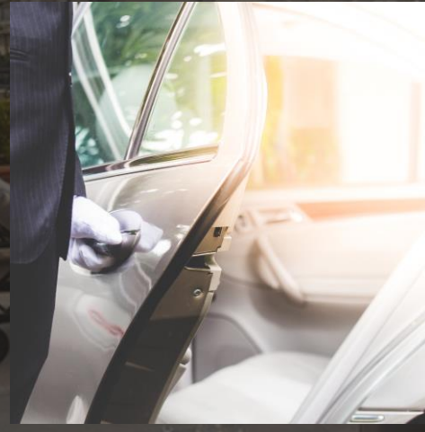
Private transfer from Monaco to Sanremo (choose between car, electric boat or helicopter)