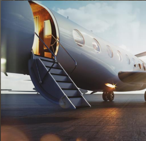
Private jet round trip to Nice with Globe Air