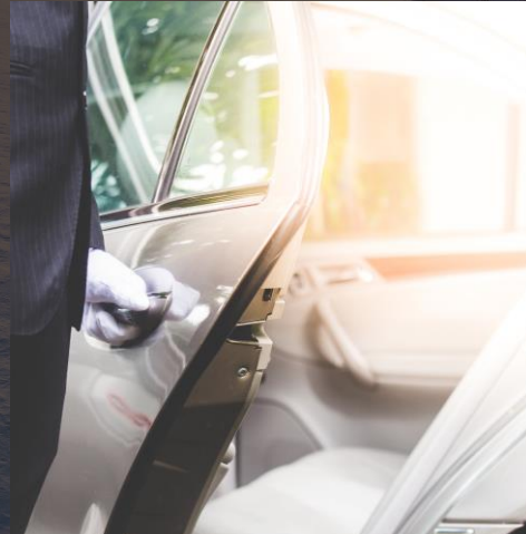
Round trip VIP transfer Nice - Sanremo